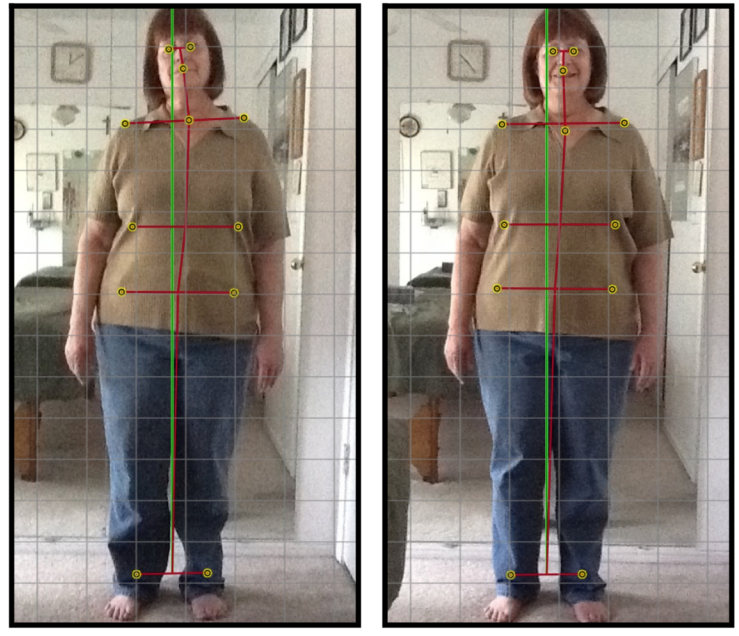
3/17/12 11:52 AM 3/17/12 1:39 PM